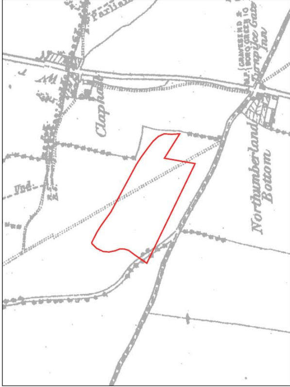
B. 1st Edition Ordnance Survey map, 1889-73