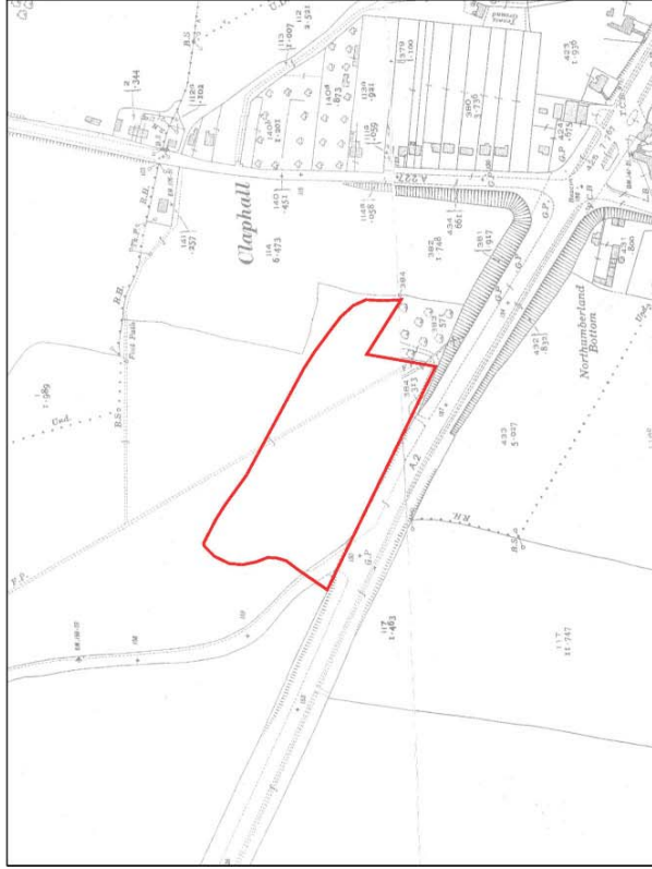
C. Ordnance Survey map, 1938